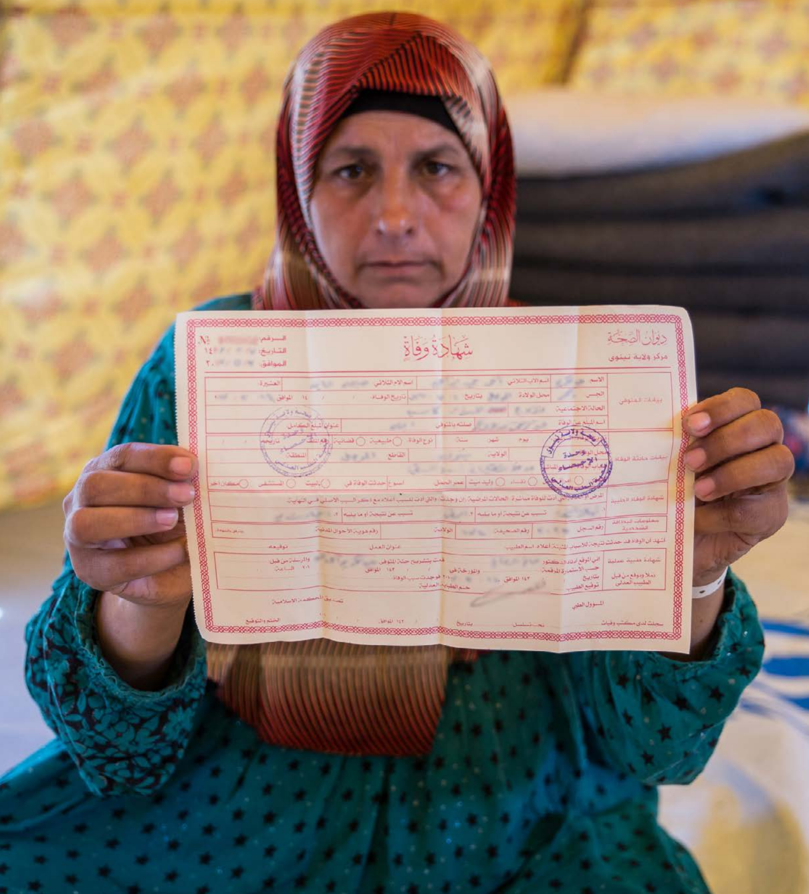
A woman holds up the death certificate of her husband who was killed during operations in west Mosul. CIVIC/Maranie Rae Staab/June 2017.