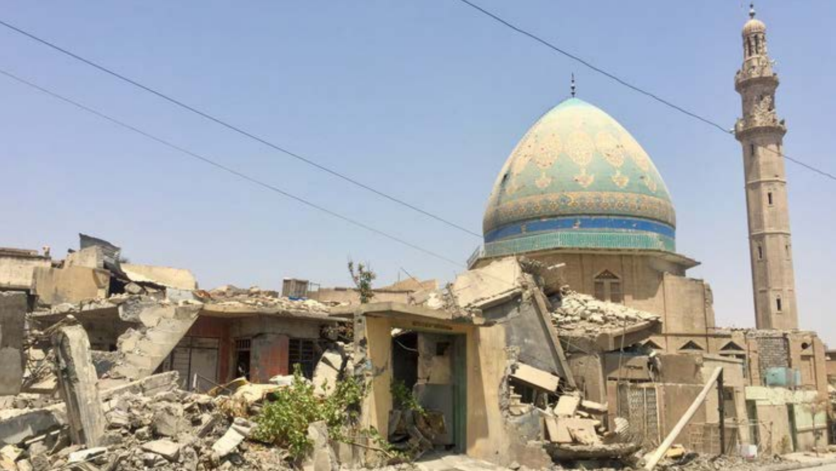
Destroyed houses in west Mosul following the fighting between the ISF and ISIS. CIVIC/Sahr Muhammedally/August 2017.