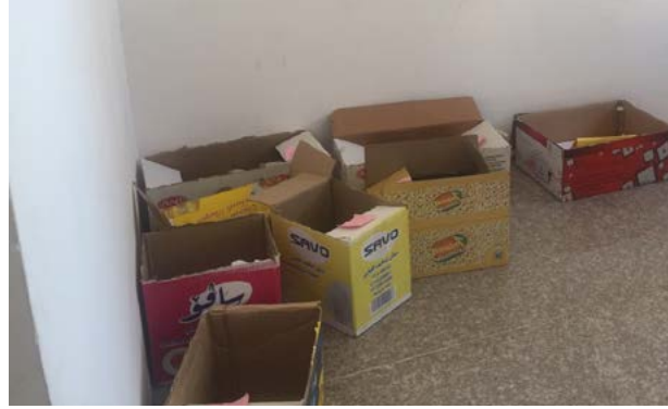
Lacking a computer-based system and filing cabinets, a compensation office within the Nineveh province uses these cardboard boxes to file compensation applications received.

Prior to 2014, compensation authorities took an average of two years to process a claim. 41 Delays have now increased due to the higher number of applications related to ISIS and the reduced staffing capacity in formerly ISIS-held areas to process them. Delays are also due to the changes instituted in