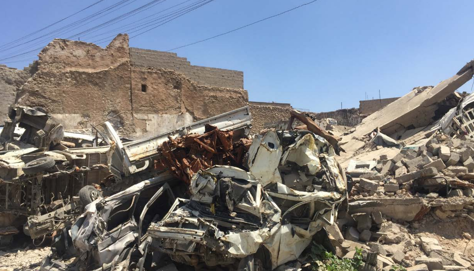
An overturned vehicle lies amongst destruction and rubble in west Mosul.