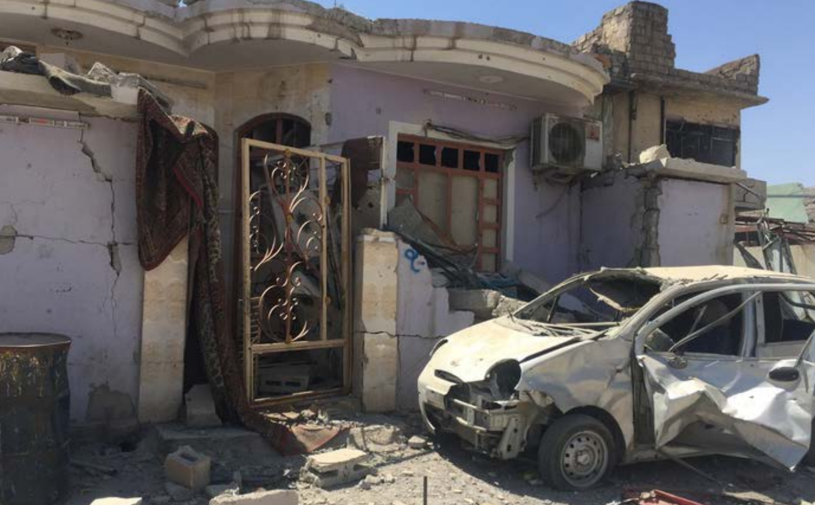
A damaged house in west Mosul following the fighting between the ISF and ISIS..

“We are a rich country and all of this ruin is due to the government, so they should pay us.” 15 —Civilian in Ramadi, September 2018.